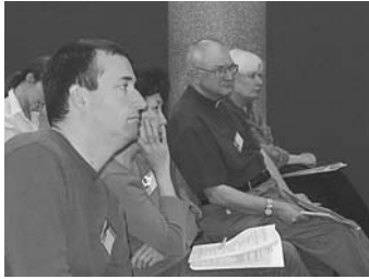
Attendees listen attentively.